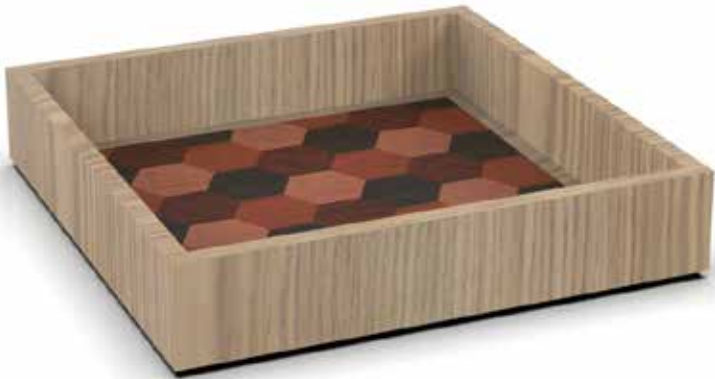
04 DECO BOXES | 2560K IMPRINT MOSAIC WITH LACQUER FINISH