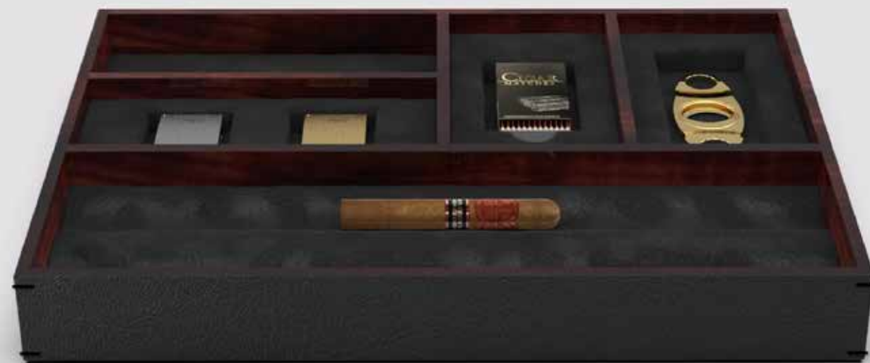
CIGAR PRESENT & SERVING TRAY | 2760 SOLID WOODEN TRAY WITH LEATHER WRAP AROUND AND ULTRA SUEDE INSERT AND DECO STITCHING