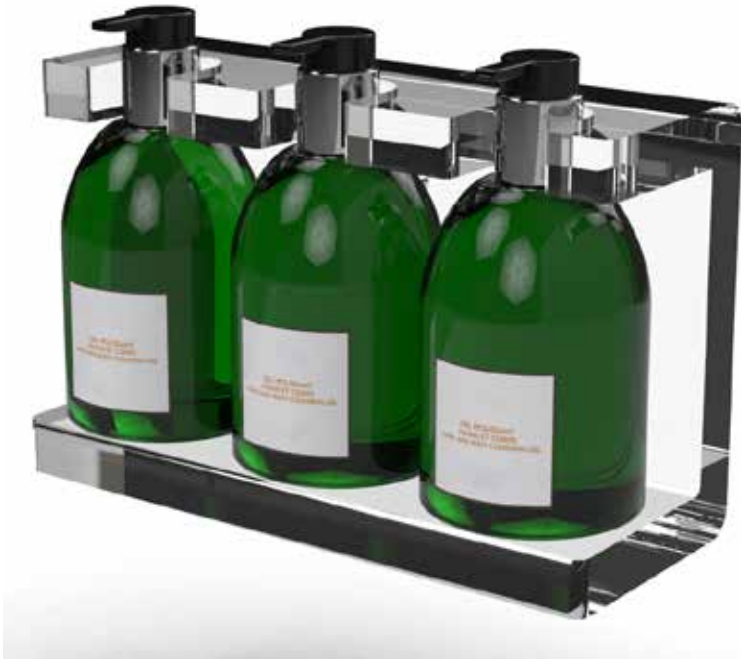
WALL MOUNTED BRACKET | 2105 STAINLESS STEEL FRAME