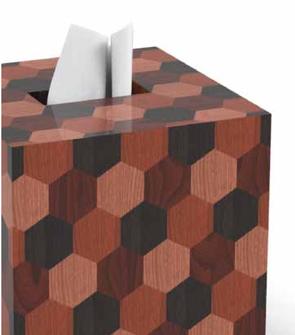
01 TISSUE BOX | 2560K IMPRINT MOSAIC WITH LACQUER FINISH