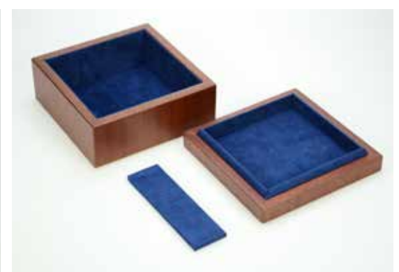
01 TISSUE BOX | 2850 MOSAIC WITH LACQUER FINISH 02 JEWELLERY TRAY | 2850 MOSAIC WITH LACQUER FINISH